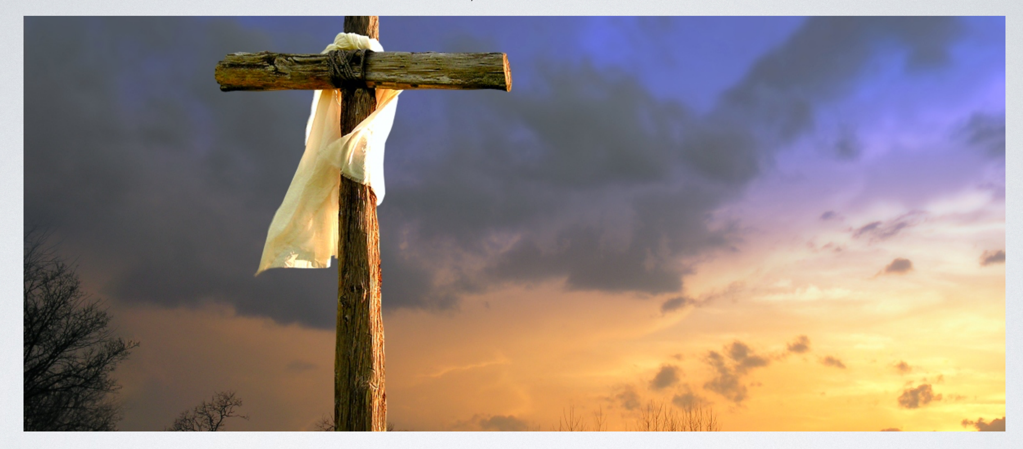
2024/25 Sunday School Year - Lesson 21